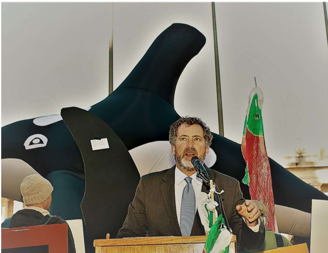
Senator Ranker stands in front of fake Orca whale at "Salish Sea Stands in Capitol Hill Day" event at the Washington State Capitol in Olympia, Feb. 13, 2017.