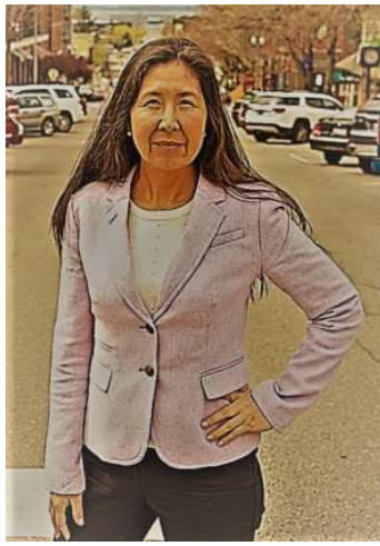
Representative Debra Lekanoff (40th LD)

The most likely candidate to be appointed is the recently elected legislator from that district – Democrat Representative Debra Lekanoff. She was elected with 67% of the vote, and the recent successful election ensures her name familiarity with local voters. She is just as extreme as Senator Ranker on all the issues that matter (maximum taxes, supports growing the abusive administrative state, a strong supporter of Gang Green, etc). Assuming Lekanoff is appointed to Ranker's seat, then this means her legislative seat will also then be vacant and require another round of the appointment process.