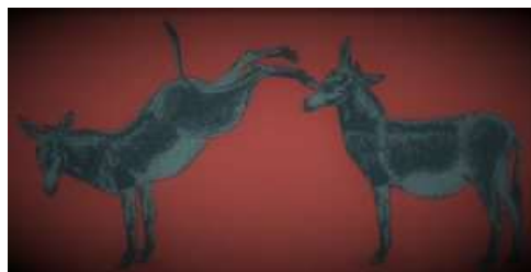
Some Serious Democratic Party infighting usually occurs during the appointment process

Senator Ranker's resignation is sure to initiate a feeding frenzy within the Democratic Party as they fight over the nomination process, first at the PCO level, and then when the elected councilmembers from San Juan County and Whatcom County and the commissioners from Skagit County convene to make the final appointment. Backroom negotiating has been occurring quietly for months now, but with the official announcement of Ranker's